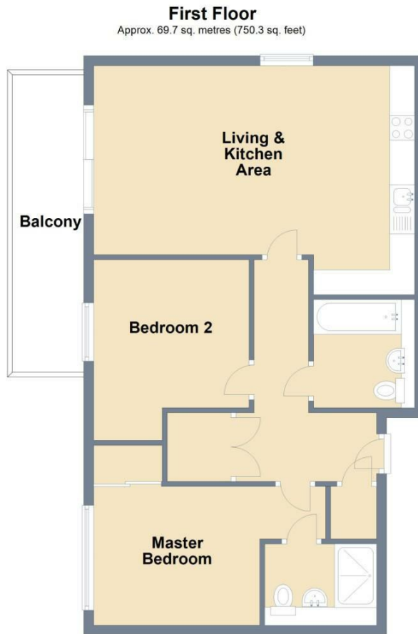
Total area: approx. 69.7 sq. metres (750.3 sq. feet)